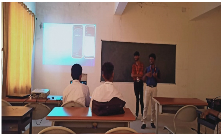
Students Participants in the event "Paper Presentation"

7. Civil Engineering department has organized an Intra College Symposium on April 3rd .2023. More than 20 students from various departments have participated in various events & won cash prizes.