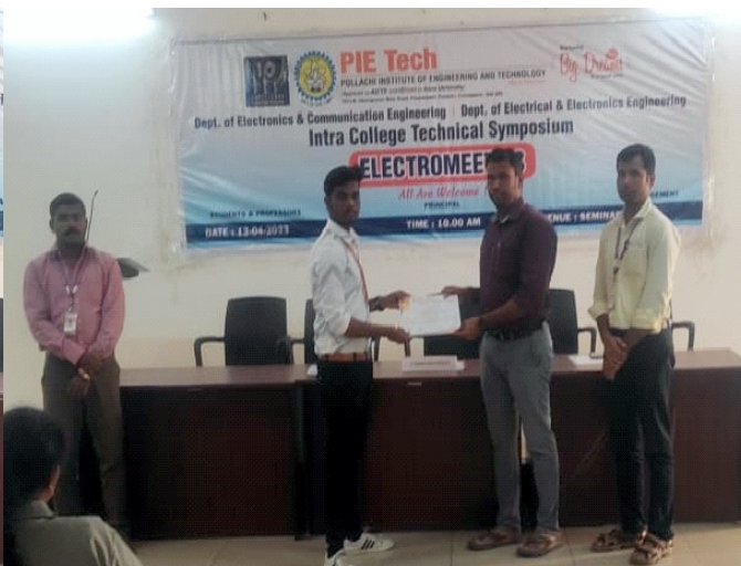
Intra College Technical Symposium - ELECTROMEET '23

7. Civil Engineering department has organized an Intra College Symposium on April 3rd .2023. More than 20 students from various departments have participated in various events & won cash prizes.