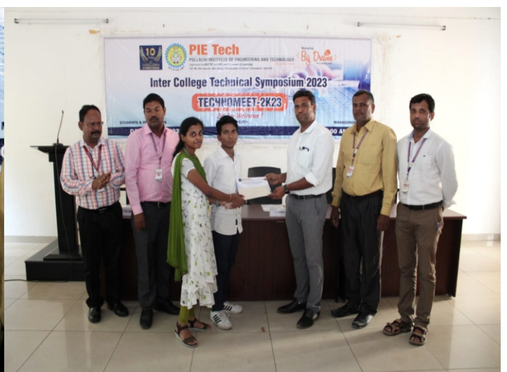
National Level Technical Symposium TECHNOMEET'2K23