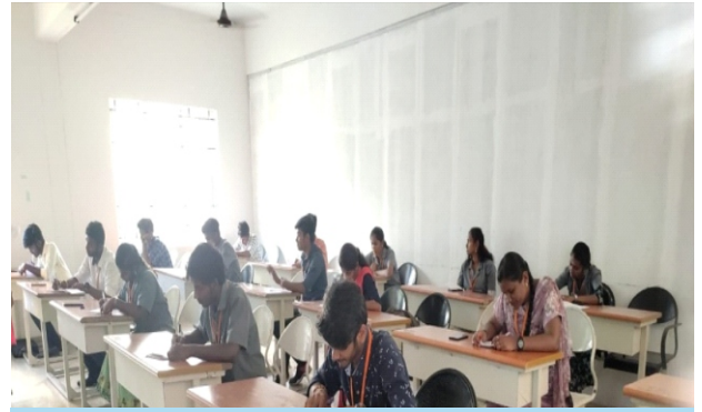
Students dynamically involved in Code Debugging

2. The Coding Club has organized a "Code Debugging" event for all the department students on April 17th, 2023.