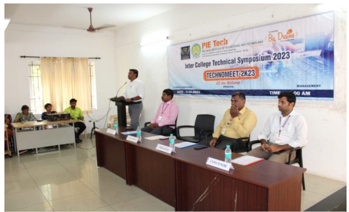
National Level Technical Symposium Technomeet'23

4. The Department of Computer Science and Engineering has organized the National Level Technical Symposium Technomeet'23 on April 28th, 2023.