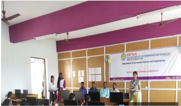
A vibrant -Symposium Yuvakranthi'23

1. Department of Computer Science and Engineering has organized the Intra College Symposium Yuvakranthi'23 on April 6th, 2023.