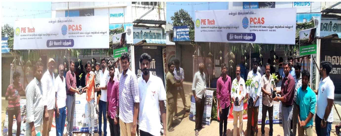
Activities of National Service Scheme (NSS)